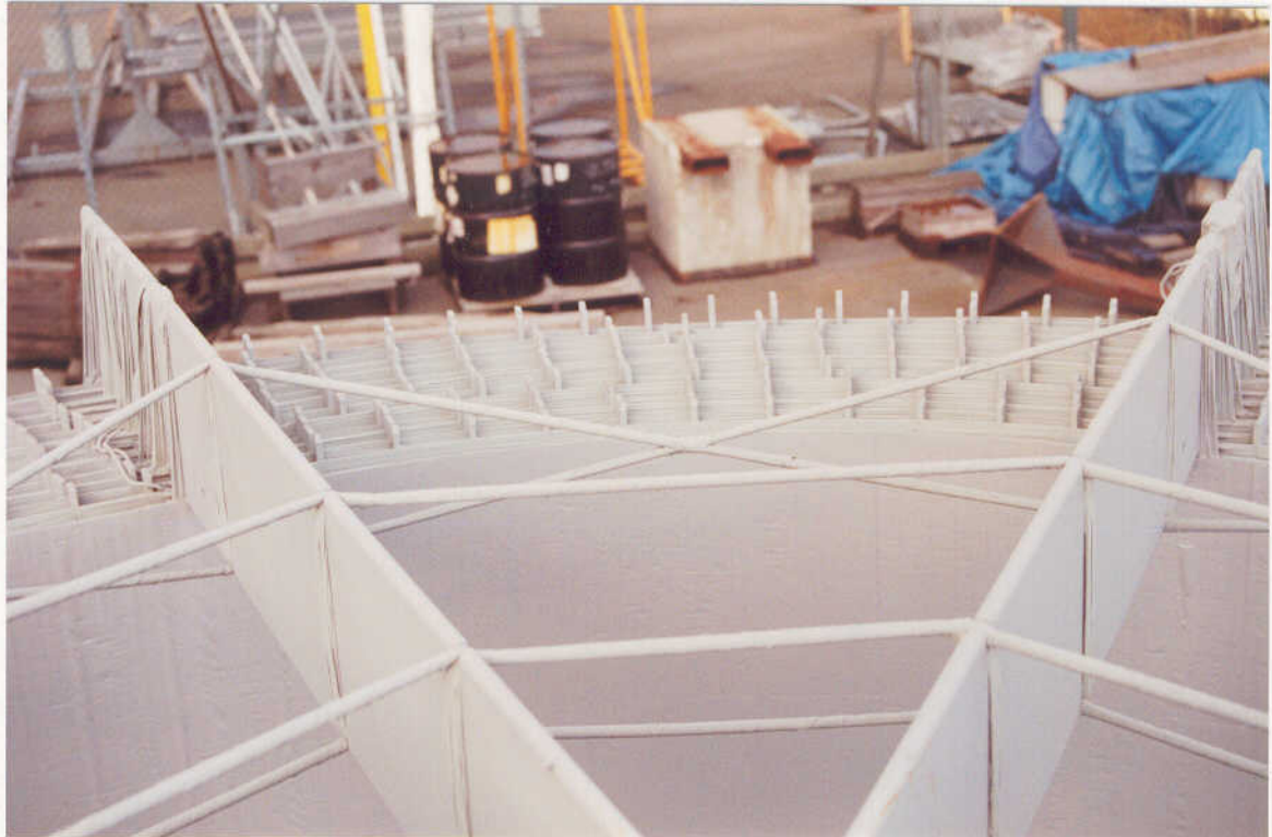
No. 21 - Clockwise (rightward direction, viewer's right) continuation of the view in the immediate preceding Photograph. Note evidence of physical damages were visible in this area.