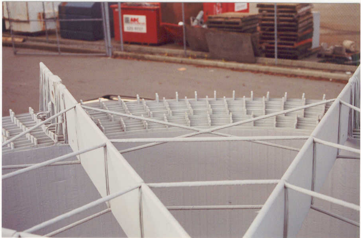
No. 20 - Clockwise (rightward, viewer's right) continuation of the view in the above Photograph. Note evidence of physical damages were visible in this area.