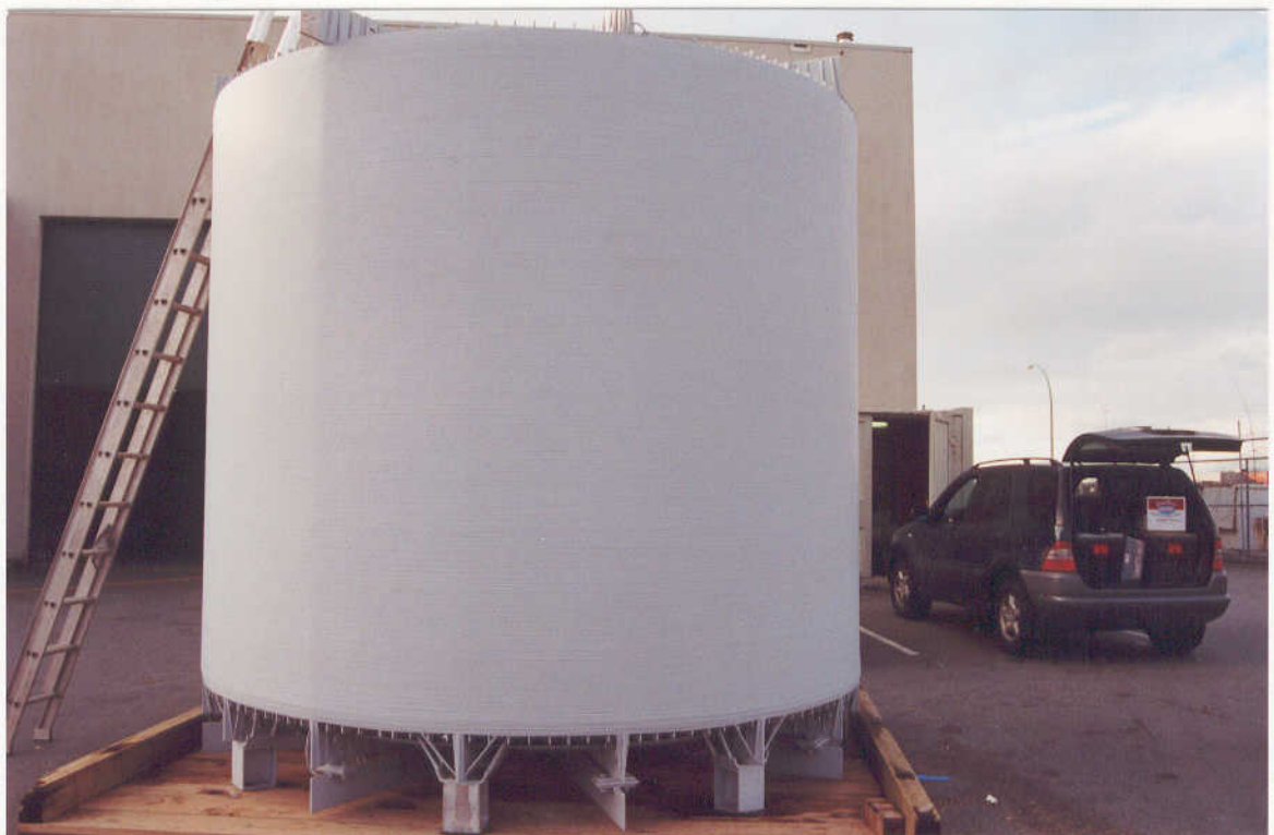
No. 2 - The same as above, but the camera was facing approximately west. This side of the Reactor was facing east.