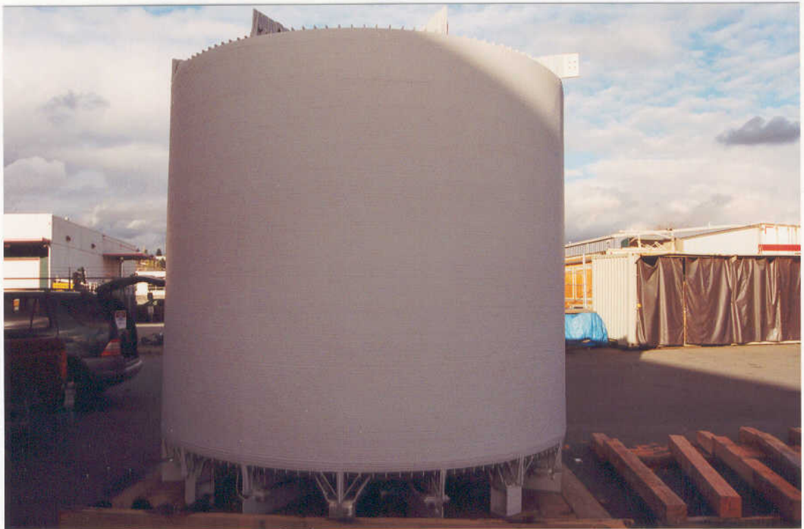
No. 6 - Another view of the Reactor while the Camera was facing approximately north. This was the side of the Reactor which was facing south.