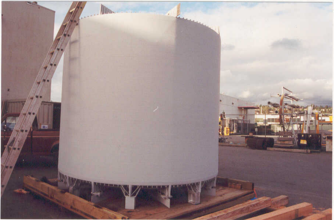
No. 5 - Another view of the Reactor while the Camera was facing approximately northwest. This was the side of the Reactor which was facing southeast.