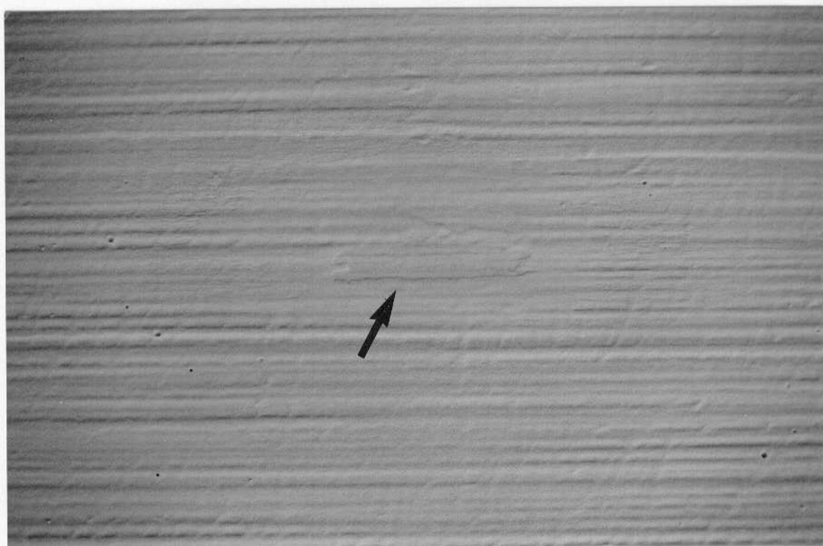
No. 3 - Close-up showing the repaired scratch on the side of the Reactor which was facing east. This scratch can be seen in one of the Photographs of Mr. Roger Robinson, CMS, before it was repaired (APPENDIX "A").