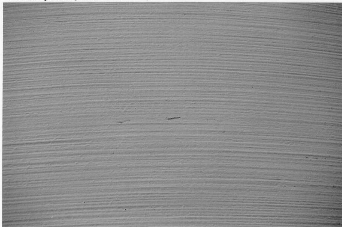
No. 4 - Minor unrepaired scratch found on the side which was facing east, above the above described repaired scratch.